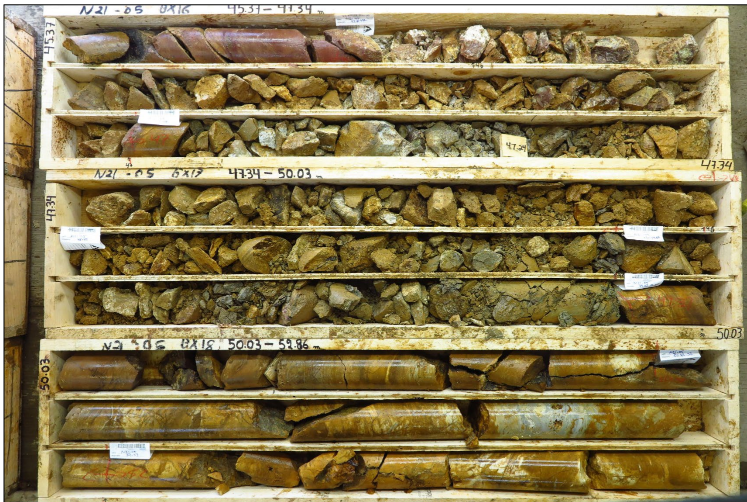
Figure 2. N21-05 Oxide Zone. Interval from 47.00 to 49.00 metres assayed 0.80 g/t.