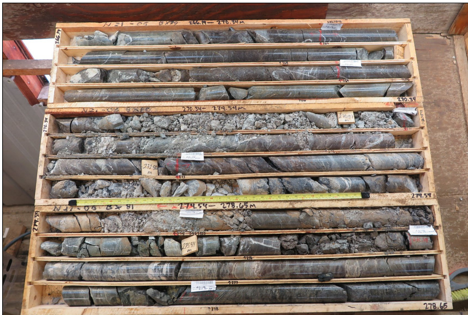
Figure 3. N21-06 Sulphide Zone. Interval from 276.38 to 277.90 metres assayed 2.01 g/t Au.