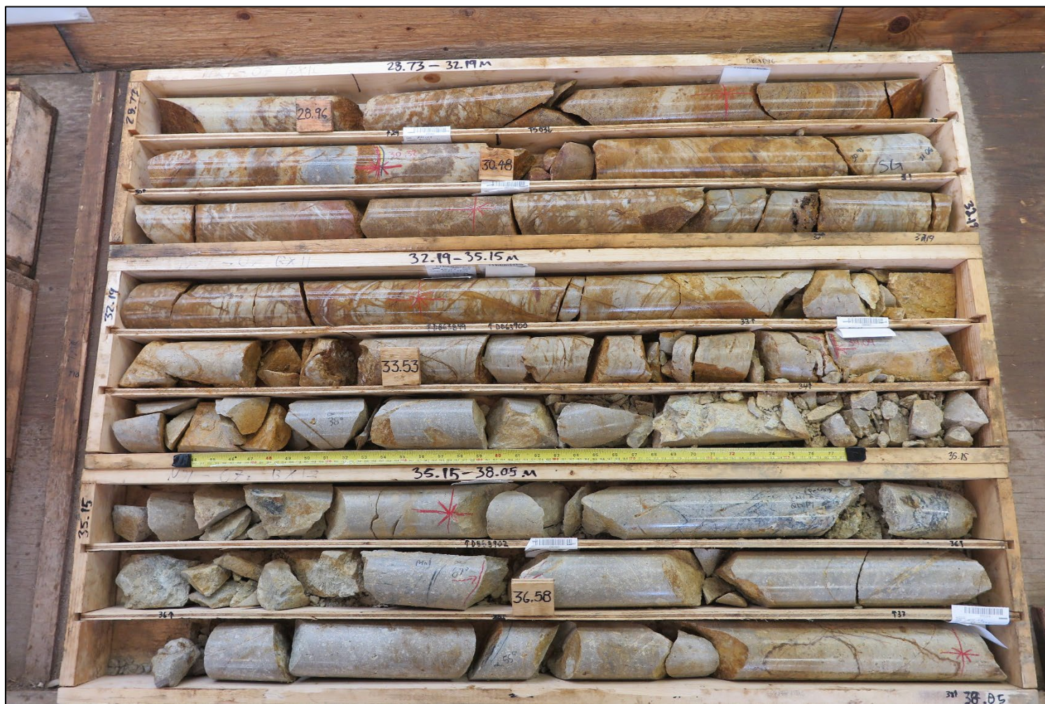
Figure 4. N21-07 Oxide Zone. Interval from 35.00 to 36.58 metres assayed 1.21 g/t Au.