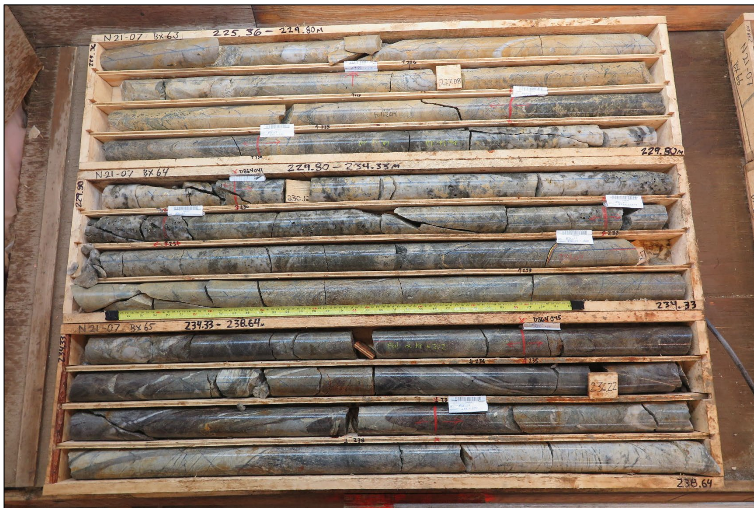
Figure 5. N21-07 Sulphide Zone. Interval from 229.00 to 239.00 metres assayed 0.53 g/t Au, including 3.49 g/t Au from 232.00 to 233.00 metres.